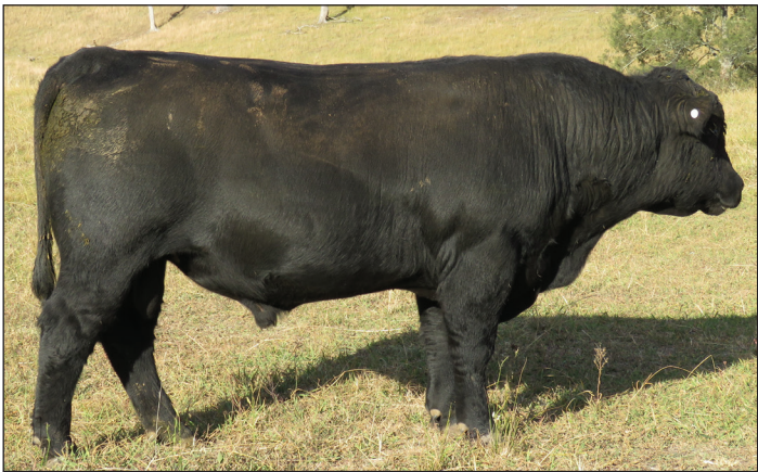
ESHN32 Sire - Pathfinder General K7