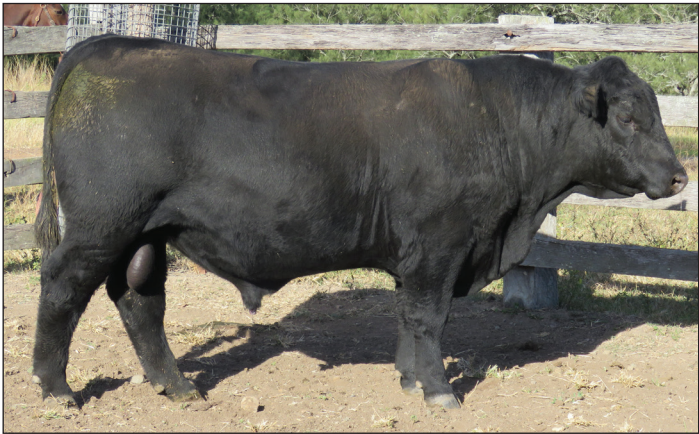
ESHN46 Sire - Musgrave Big Sky