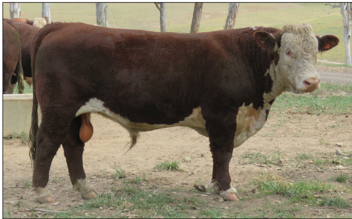
CRKN33 Sire - Talbalba Advance K134