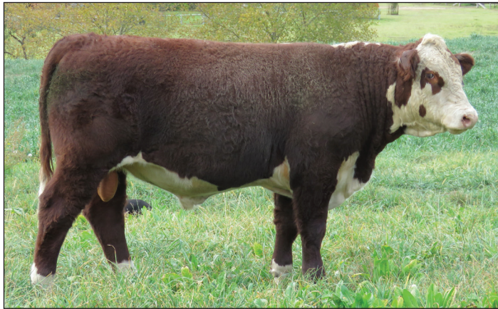
CRKP104 Sire - Oak Downs Lawloit L75

Of interest is some trial work being done by the DPI on the Angus progeny test cattle to find a more true indicator of muscle than EMA data. The results are looking promising regarding muscle shape to reveal overall muscularity and we feel on the right track as this has also been our approach to selecting for muscularity for a long time.